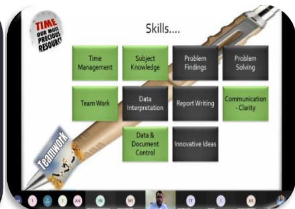
Resource Person delivering the Special Lecture